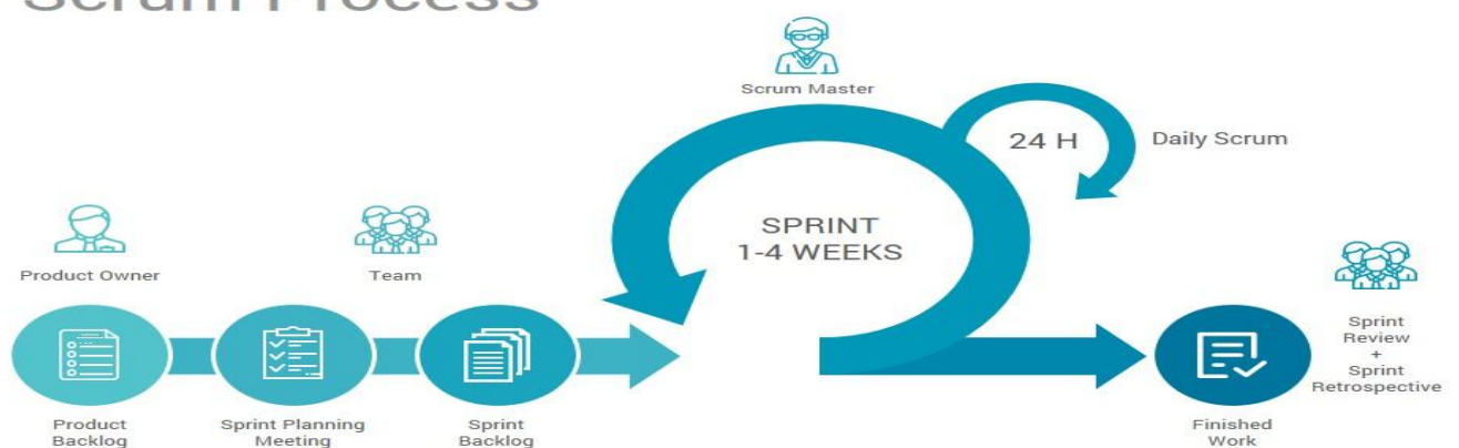
Image2 - Scrum Proces